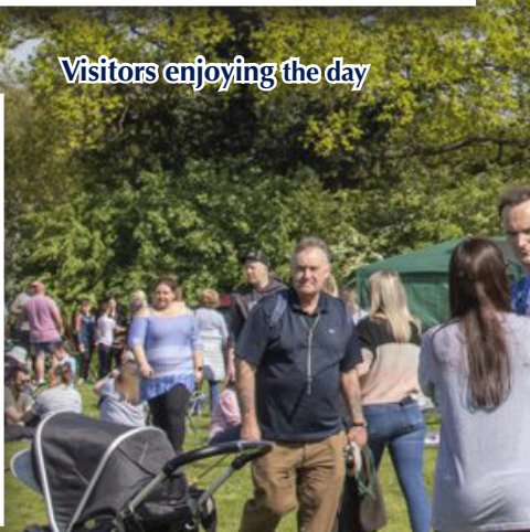
Visitors enjoying the day