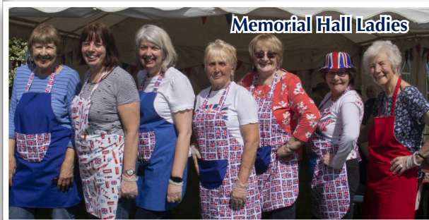
Memorial Hall Ladies