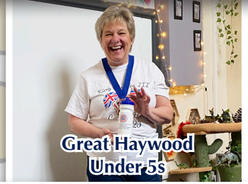
Great Haywood Under-5s