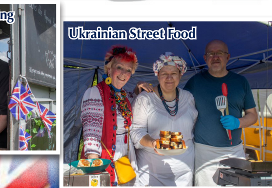
The Council's Events Committee would like to thank everyone who made the day so special, especially the volunteer Stewards.