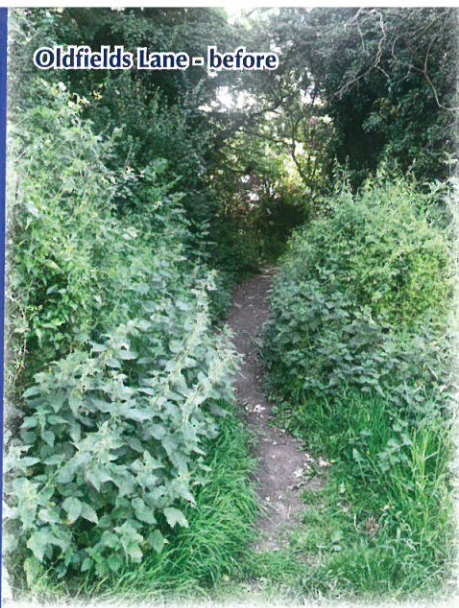
Oldfields Lane - before

In total, the budget for 2023/24 has been set at £322,263.52 including £6,042.71 local Council tax Support Government Grant, £43,994.52 carried forward for preliminary works to the JPF and £100,000 moved from Reserves to be reimbursed from section 106. The final charge to you, the local taxpayers, will be £176,226.29. This equates to an annual charge of £92.39 per Band D property; £82.12 per Band C and £71.86 per Band B or a 2.9% increase on the 2022/23 level.