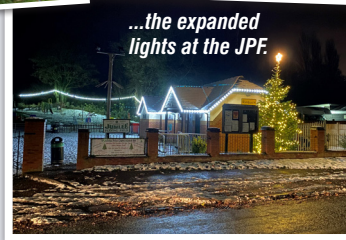
...the expanded lights at the JPF.

As announced in the Autumn Newsletter, we were looking forward to welcoming the Mini-Bloomers to this year's event. With a £250 grant from the Council, they had organised a stall for pocket money toys, Christmas lucky bags and all sorts of goodies for the children.