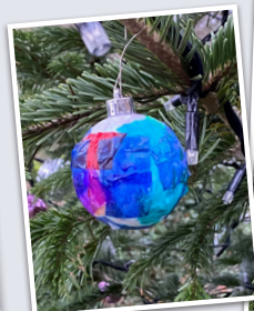
Baubles decorated by children from the Great Haywood Under-5s and St John's nursery.