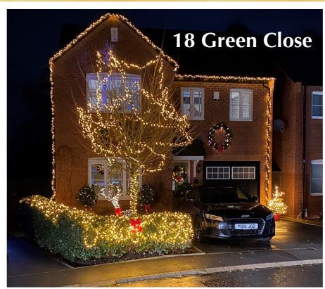
18 Green Close

The winner of the street competition was Devereux Gardens for the second year.