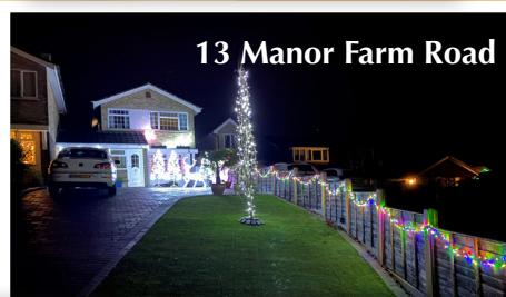
13 Manor Farm Road