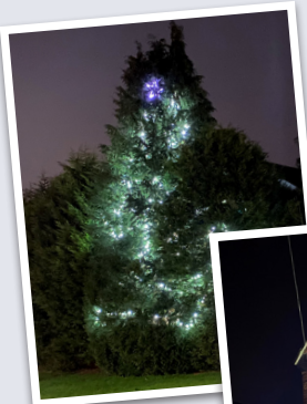
The tree at Trent Square Great Haywood