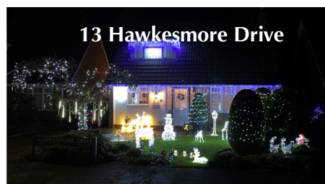
13 Hawkesmore Drive