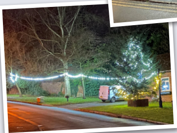
The tree and other lights at the Parish Centre