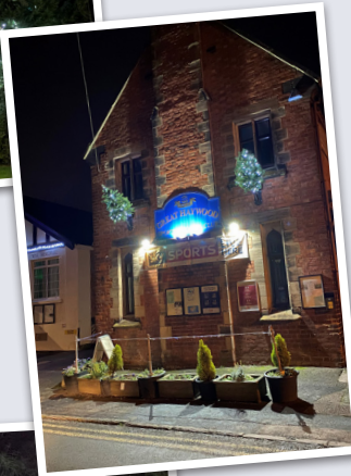
The wall trees at the Sports and Social Club