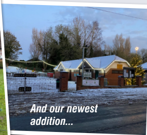
And our newest addition...