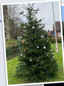
The tree at Colwich School

Whilst disappointing, we are still delighted with how our village Christmas Lights provision has grown over recent years from nothing to now include: