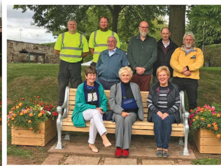
The renovated bench at Abbeyfields Green